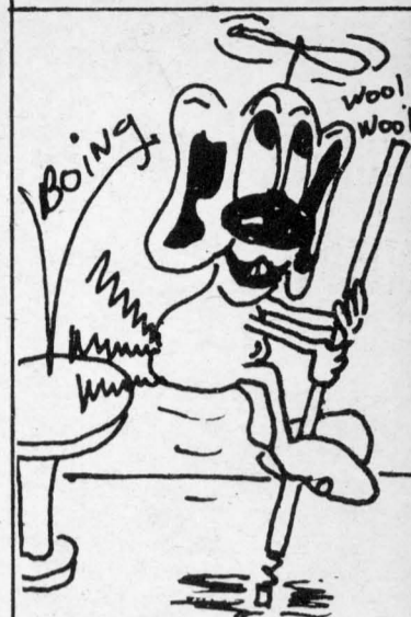
FRAZZLE-TAILED TABLE HOPPER

Habitat — cafeteria. This critter bounds from table to table collecting the latest gossip in it's large ears.