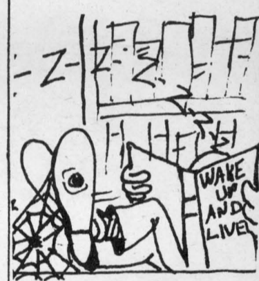
SNOOZUS - LIBRARUS Habitat—campus library.

SPONGUS -AUTOMATTUS Habitat — cafeteria. This callous beast thrives on a diet of quarters, nickels and dimes.